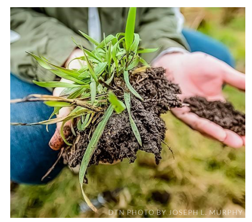
An lowa farmer shows off soil on his farm, pointing to the structure and water holding capacity after growing cover crops.

Private companies also are expanding their various carbon credit or regenerative agricultural programs. Cargill recently announced it would expand its RegenConnect to nine more states as well as parts of Europe this year. Indigo Ag is now working with more food companies to help reduce carbon